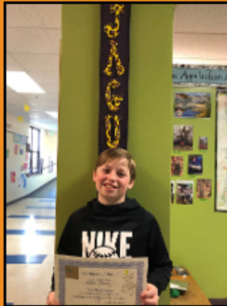
ELA - JACKSON